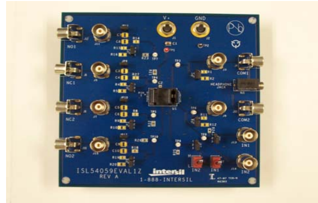
FIGURE 1. ISL54059EVAL1Z THROUGH ISL54064EVAL1Z EVALUATION BOARD