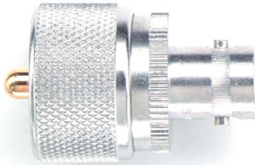
Model 3286 Adapter, BNC (Female) to UHF (Male)