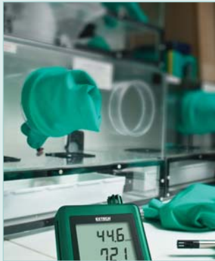
Monitor and record temperature and humidity values in the calibration rooms, office, clean rooms, and storage facilities