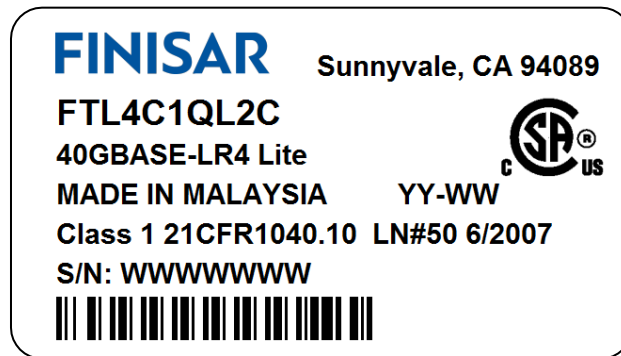
Figure 3 – FTL4C1QL2C label (not to scale)