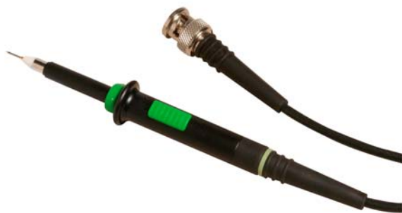
Model 6494 Modular Passive Oscilloscope Probe with Readout Actuator