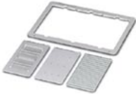
Magazine insert, for CMS-WMU, accepts: 3 PABA marker bars

Please be informed that the data shown in this PDF Document is generated from our Online Catalog. Please find the complete data in the user's documentation. Our General Terms of Use for Downloads are valid ( http://phoenixcontact.com/download )